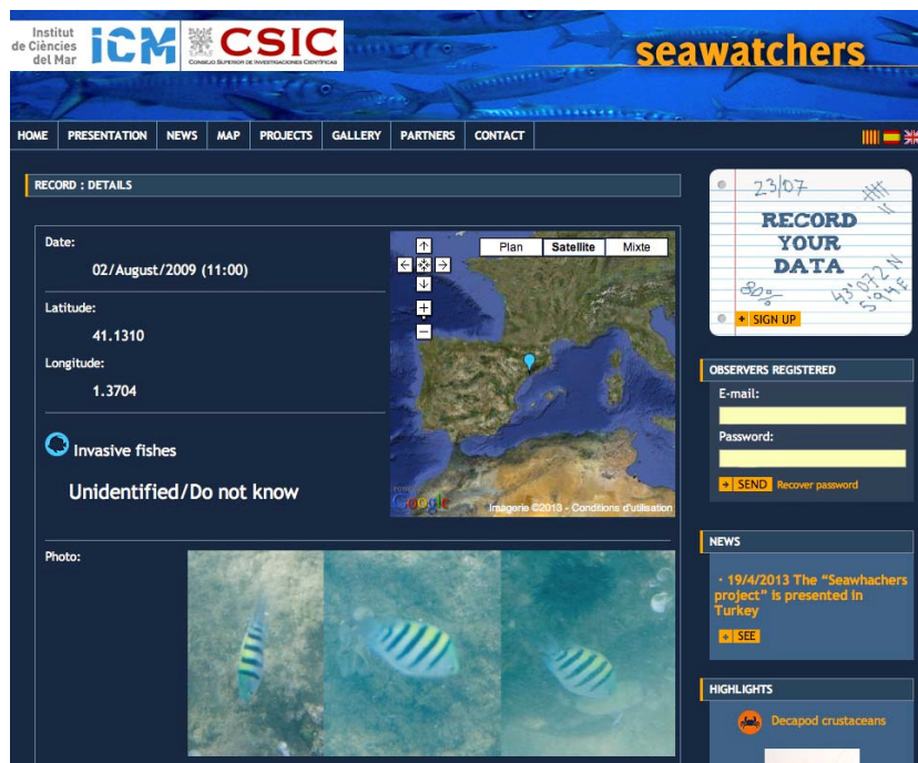
Figure 1. Screenshot of ‘Seawatchers’, showing the posted record of Abudefduf saxatilis . Date of observation, location, geographical coordinates, map and pictures are reported. The full page is available at: http://www.observadoresdelmar.es/observacio-detall.php?projecte_id=9&id=409

(Pomacentridae), a family of small coloured fishes occurring primarily on the coral reefs of tropical seas (Allen 1991). This species is also abundant in the Caribbean reefs and in the tropical coast of western Africa to Angola where it can form large feeding aggregations of a few hundred individuals (Randall 1996). In the Indo-Pacific region the Sergeant major is replaced by the Indo-Pacific Sergeant major Abudefduf vaigensis (Allen 1991), a closely related species. The latter has already entered the Mediterranean Sea through the Suez Canal (Tardent 1959; Goren and Galil 1998; Vacchi and Chiantore 2000) and has now established itself off the coast of the Levant with increasing numbers (CIESM 2012). On the other hand, to the best of our knowledge, there is no published evidence of the occurrence of A. saxatilis in the Mediterranean Sea.