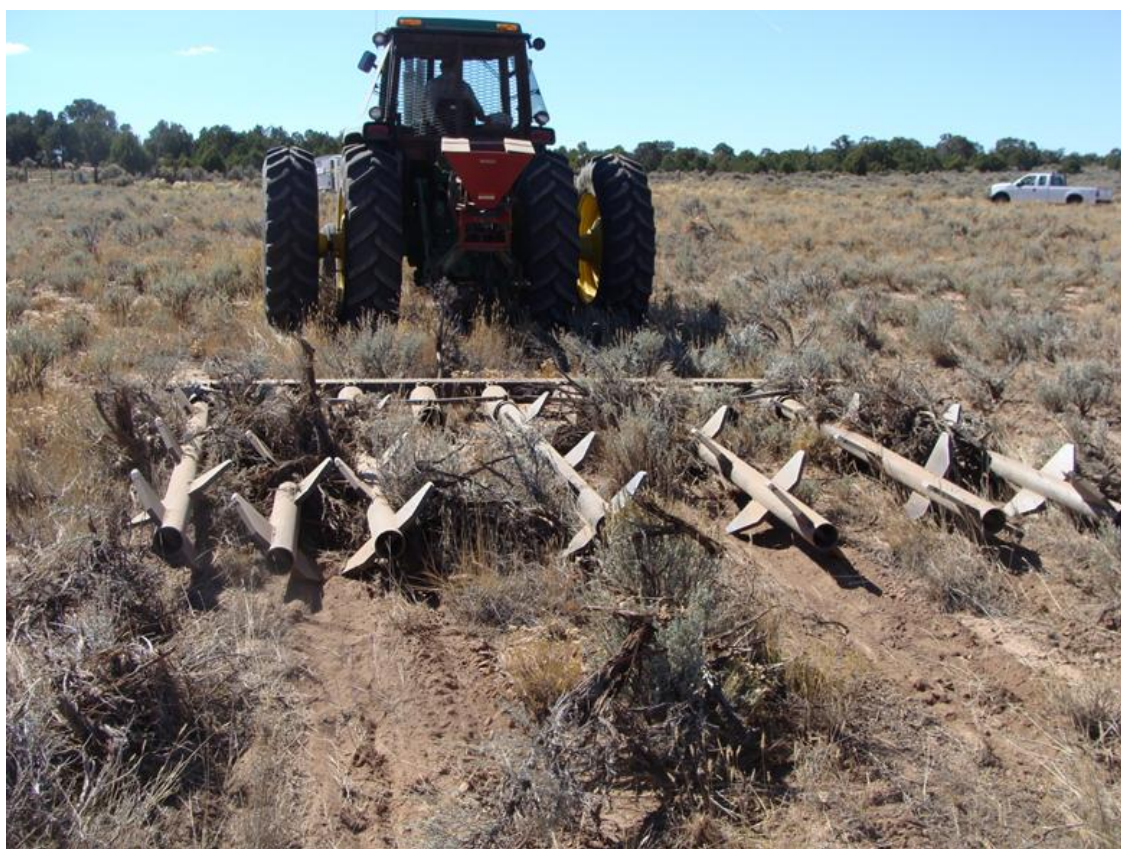
Figure 1. Photo of a dixie harrow. Toothed metal pipes are dragged behind a tractor. This can remove some of the shrubby overstory and thin out understory plants (grasses and forbs). Desirable seeds are spread in front of the tractor so that they are incorporated into the soil as the harrow passes over them.

herbivory than other common ways of measuring vegetation such as density, cover, or biomass (West 1985). Sites were sampled between May and August from 1984 to 2008.