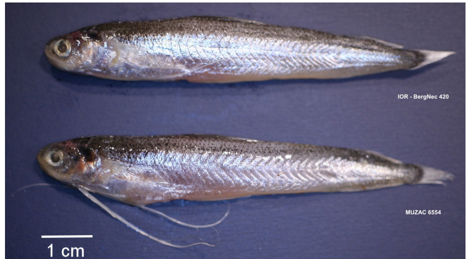
Figure 1. Specimens of the Smallscale codlet Bregmaceros nectabanus collected from the Adriatic Sea (near Bari, Italy).

and Golani 2016). The Smallscale codlet is distributed up to a depth of 350 m (Kulbicki et al. 1994) and is native to the Indo-West Pacific and western Indian Ocean, including the Red Sea (Harold and Golani 2016). According to Harold and Golani (2016), B. nectabanus is not present in the Atlantic Ocean, and, according to Masuda et al. (1986), records from the southeast Atlantic should be reassigned to a different species, namely B. neonectabanus Masuda, Ozawa & Tabeta, 1986.