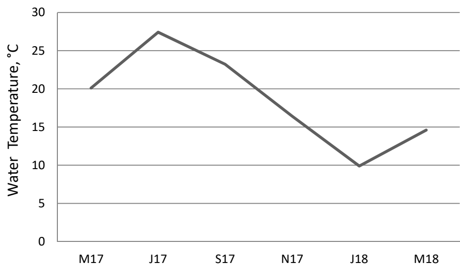
Figure 3. Water temperature at Gramiccia canal (see text for x-axis acronyms).

in females (average: 35.7 \pm 2.9 mm). A between-sex comparison of log-transformed carapace length data per sampling date did not show any significant difference (ANOVA: p > 0.05 ). Male crayfish exhibiting the copulatory organ (CL ranging from 26.60 mm to 56.90 mm) were found with higher numbers at spring-summer sampling dates (July and September: almost 80% of males), and decreased during the other months.