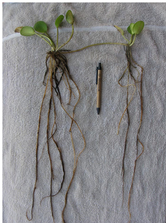
Figure 3. Young Limnobium laevigatum plant (LHS) with a younger plant produced from a ramet (RHS). Scale: pen length 12.5 cm.