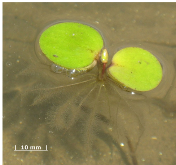
Figure 2. A new small plant of Limnobium laevigatum , with two almost-circular initial leaves, showing the spongiform texture on the underside of the larger leaf and the start of the next pair of shoots, with the submerged roots with root hairs clearly visible.

There is no doubt that L. laevigatum is well-established in the Zambezi River, downstream from Lake Kariba and on the edge of the lake, as well as in at least two peri-urban water bodies in Harare, Zimbabwe. The absence of a larger number of records in the area is surprising, as both Lake Kariba and the Zambezi River straddle an international border and are utilized extensively by fishermen, so are likely to be infested far beyond the few records registered here.