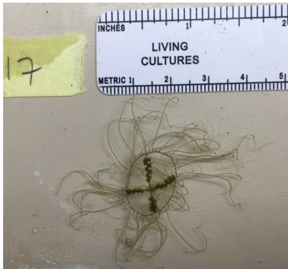
Figure 2. Image of Gonionemus vertens collected in New Jersey.

nucleotides were removed by Performa Gel DTR Gel Filtration Cartridges (EdgeBio, Gaithersburg, Maryland, USA). Both strands of each product were sequenced using the same primers used to generate the fragment. Raw sequences were edited and aligned using 4 Peaks ( http://nucleobytes.com/4peaks/index.html ) and CLUSTAL Omega (Sievers et al. 2011; http://www.ebi.ac.uk/Tools/msa/clustalo/ ), and searched for homology against all known genetic sequences using the BLAST algorithm (Altschul et al. 1990).