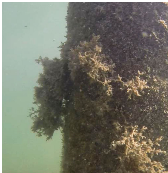
Figure 4. Amathia verticillata on a pier piling in Franklin's Bay.

Of interest are the observations of Whitmore et al. (2005) who noted that, in the Gulf of California, A. verticillata living in subtidal waters sometimes breaks free and is carried into mangrove forests where they can live for many weeks. We interpret the colonies amongst the mangroves in Tortuga Bay to be linked in a similar manner to colonies on the bay floor proper.