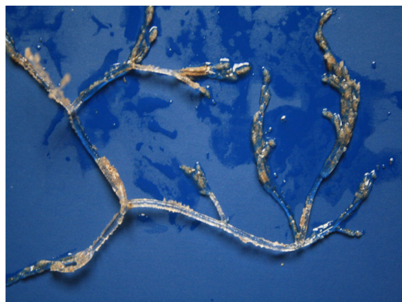
Figure 3. Amathia verticillata colonies from shallow waters off the beach in Tortuga Bay.

International Workshop on Marine Bioinvasions of Tropical Islands at the Charles Darwin Research Station (CDRS) in Puerto Ayora, Santa Cruz Island, during February 2015. Several previously undetected, non-native, species were collected; we report here on the discovery of Amathia verticillata in the Galápagos. Prior to this discovery, only two ctenostome bryozoans [ Buskia seriata Soule, 1953 and Amathia vidovici (Heller, 1867)] had been reported from the Galápagos Islands (Banta and Redden 1990; Banta 1991).