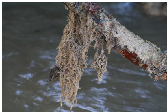
Figure 2. Amathia verticillata colonies on mangrove limbs and roots in Tortuga Bay.