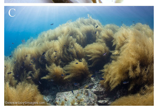
Figure 1 . Sargassum horneri morphology and life cycle. (A) Recruit, (B) Mature thallus with reproductive receptacles indicated by arrow, (C) Thick canopy on a shallow reef.

coast of North America, where it has spread rapidly since it was first detected in Long Beach Harbor, California, USA, in 2003 (Miller et al. 2007). We also discuss potential factors influencing the spread of this species and the implications of its invasion to native ecosystems.