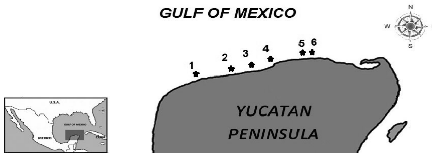
Figure 1. Map of study area in the Southern Gulf of Mexico along the northern Yucatan Peninsula, Mexico, showing sites where Caulerpa ollivieri was detected.

al. 2007; Pacheco-Cervera et al. 2010; Ortigón-Aznar et al. 2001; Ortigón-Aznar et al. 2009; Federicq et al. 2009; Ortigón-Aznar et al. 2010; Mateo-Cid et al. 2013). However, none of these studies detected C. ollivieri .