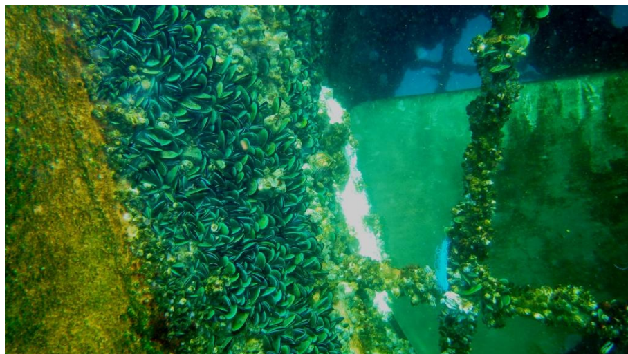
Figure 2. Asian green mussel fouling on the KM Tidar, Banda Naira, 28.10.2013.

test using the free software R (R Core Team 2013) to test whether the BCIs of mussels differed significantly between the various origins. A reciprocal data transformation was conducted prior to the analysis to achieve normality.