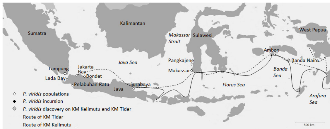
Figure 1. Routes of the KM Tidar and the KM Kelimutu in Indonesia and locations along the route where Perna viridis occurs and where it was found in this study. Ambon Bay and Banda Naira are outside the natural distribution of the species.

west (Williams 2009). However, there have been almost no studies to evaluate whether domestic ships serve as a significant vector for transfer of marine species between the different biogeographic regions of the Indonesian archipelago.