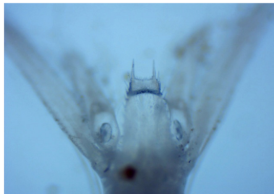
Figure 1. Dorsal view of the statocysts and truncated telson of Hemimysis anomala collected from the Erie Canal, New York (Photo: Amalia Driller-Colangelo).

Sampling was conducted several hours after sunset because the diel migration of Hemimysis results in its absence from the water column during daylight hours (Boscarino et al. 2012). Nearly all of our sites were illuminated with artificial lighting, but the proximity of the light to the