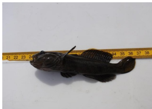
Figure 3. Parental male (black colouration) round goby captured in the lower River Oder at river kilometre 703.5 on September 10, 2013.

Therefore, it appeared highly likely, that the invasion of round goby into the lower Oder Valley