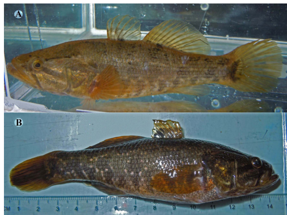
Figure 1. Perccottus glenii from the Hirskiy Tikych River. A – live specimen in aquarium, B – dead specimen showing scale.

Standard errors (m) were calculated for mean parameters (M), and maximum and minimum values attained. Maturity stage was identified using a scale developed by Pravdin (1966): Stage I – juveniles, immature; Stage II – gonads very small, eggs almost invisible; Stage III – maturing, eggs visible by eye, weight of gonads increasing, male gonads becoming whitish-pink; Stage IV – mature, eggs and sperm mature, gonads have reached maximum weight but do not emit under light pressure; Stage V – spawning, eggs and sperm emit under light pressure of the belly, weight of gonads decreasing from start to completion of spawning; Stage VI – spawning has occurred, sexual opening inflamed, gonads look like empty sacs, sometimes with residue of sexual products.