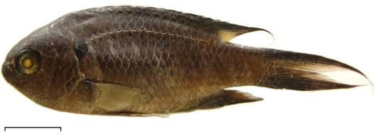
Figure 2. Neopomacentrus cyanomos catalog number: VER-PEC-02183 captured on coral south of Veracruz, Gulf of México. Scale bar 10 mm.

Neopomacentrus cyanomos is characterized by slender ovate body, moderately compressed, its depth 2.2 to 2.6 in SL; head length 2.9 to 3.8 in SL; snout length 3.9 to 7.0 in head length; pectoral fin length 3.8 to 4.7 in SL; pelvic fin length 3.2 to 4.7 in SL. Dorsal fin XIII, 11-12; anal fin II, 11-12; pectoral fin 17; caudal fin