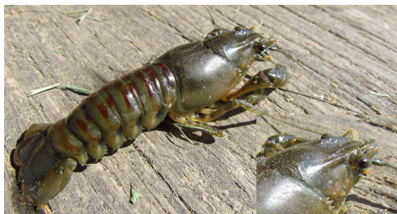
Figure 2. An adult Orconectes limosus with its characteristic colouration and spiny cheeks (inset).