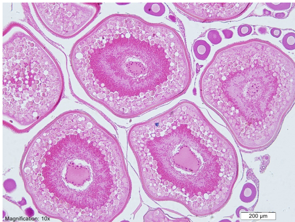
Figure 3. Histological section of a Cyprinus carpio ovary showing high frequency of oocytes with complete vitellogenesis (Hematoxylin-Eosin).

C. carpio specimens were collected by fishermen hired by a local project for monitoring the occurrences of non-native species in the catches. The project was conducted between January 2010 and December 2011, with sampling