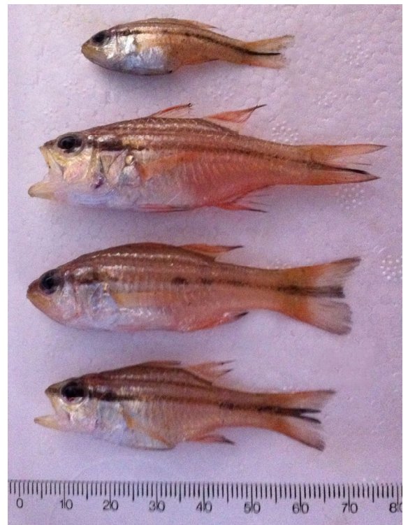
Figure 1. Apogon fasciatus captured from the Gulf of Antalya, Turkey, on December 1st 2011 (four out of the five individuals are showed).

On December 1st 2011, five individuals of A. fasciatus (Figure 1) were collected from the Gulf of Antalya (Figure 2). The capture was realized by a trawl fishery boat (R/V Akdeniz Su) at a depth of 30-40 m, on sandy and rocky substrates. The specimens were identified