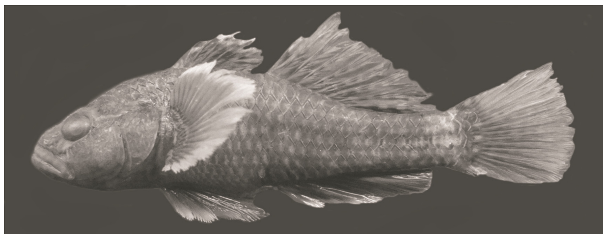
Figure 1. Specimen of Butis koilomatodon collected in the Amazon coastal zone.