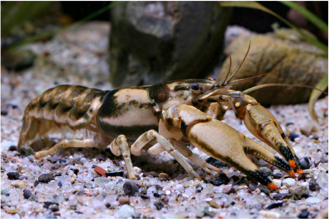
Figure 2. Orconectes neglectus neglectus .