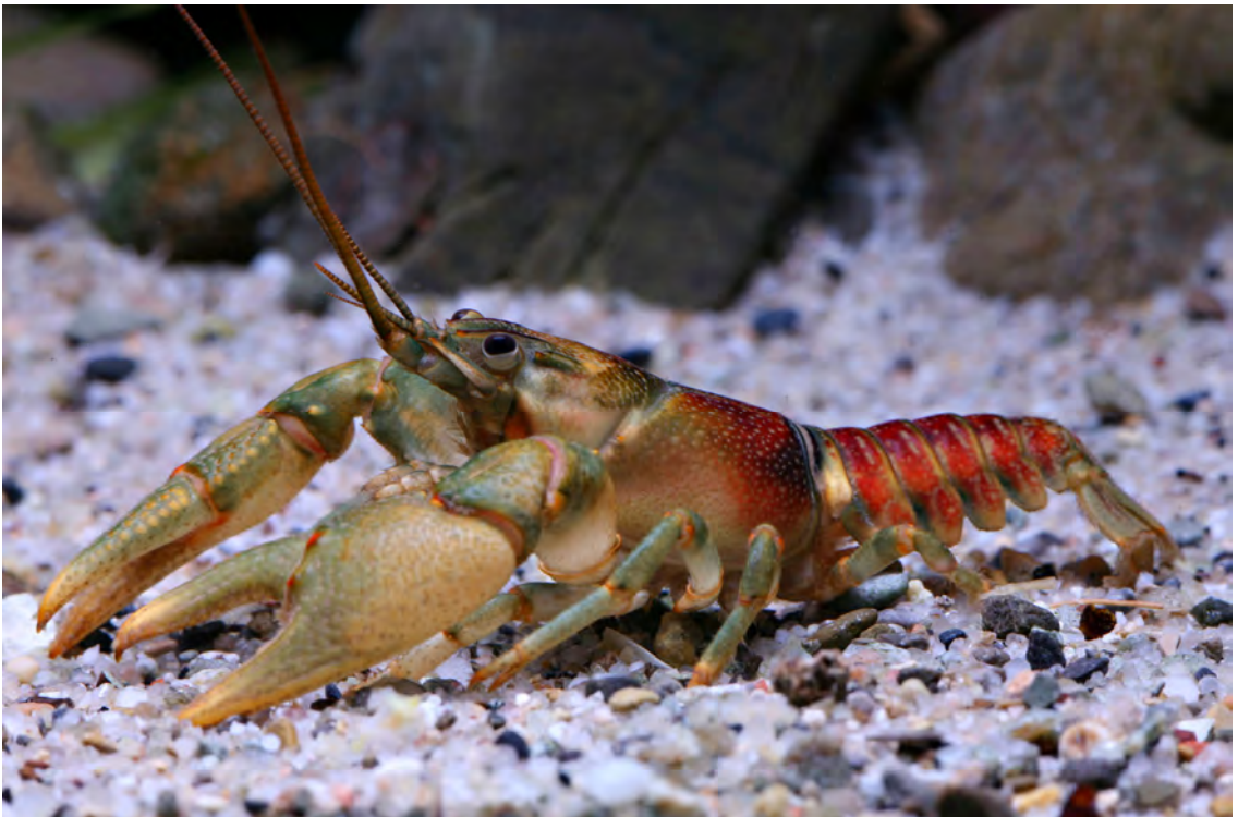
Figure 3. Orconectes eupunctus .