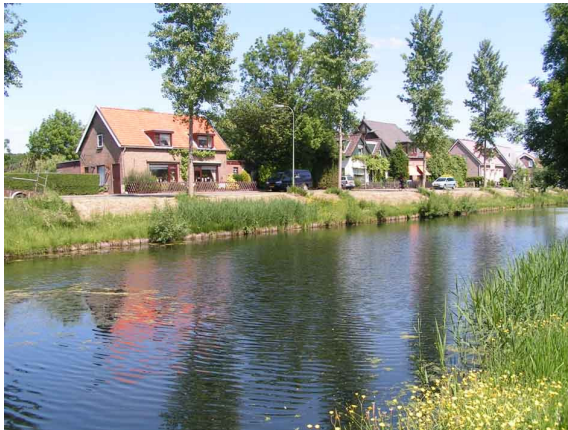
Figure 2. The Dutch locality in the southeastern part of Dordrecht (prov. of Zuid-Holland) inhabited by a population of V. acerosus .

Accidental escape or deliberate release from a garden pond or aquarium seems the most likely explanation for the occurrence of V. acerosus in Dordrecht. The fact that it readily reproduces in garden ponds suggests that this species, once escaped, can easily spread. The site at Dordrecht is connected to other water systems and the finding of a specimen in a nearby river suggests that spreading may already have taken place. It is likely to go unnoticed due to its strong resemblance to the native species.