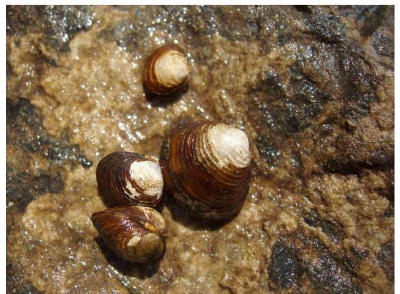
Figure 1. Corbicula fluminea specimens from the Lacarón site.

Recently two exotic species of freshwater bivalves, both from Southeast Asia, have been introduced into Iberian inland waters. The zebra mussel Dreissena polymorpha (Pallas, 1771) was first reported in Spain from the Ebro River basin, in the early 1980's (Altaba, 1992). Corbicula fluminea (Müller, 1774) (Figure 1) was found for the first time in Iberian waters in 1980 in the Tagus River estuary (Mouthon, 1981). Later, the species was reported from the Douro River, Oporto, Portugal (Nagel 1989) as well as the Miño and the Douro rivers, Spain (Araujo et al. 1993). Both species are considered potential invasives because, they are characterized by early sexual maturity, high reproductive potential and a remarkable ability to adapt to the environments they colonize (Darrigran 1997). Such characteristics allow exotic bivalves to disperse quickly in great numbers (Darrigran and