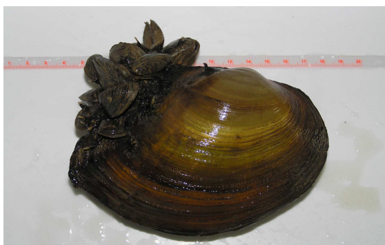
Figure 2. Sinanodonta woodiana (Lea 1834) from Cosmesti (Siret River) (Photograph by O. P. Popa).