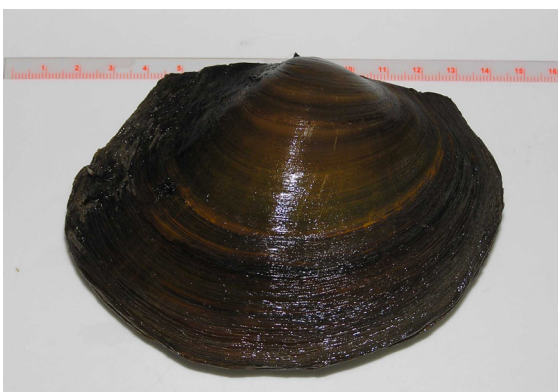
Figure 3. Sinanodonta woodiana (Lea 1834) from Danube Galati Cocuta Beach.

collected specimens were placed in the Molluscs Collection of the “Grigore Antipa” National Museum of Natural History.