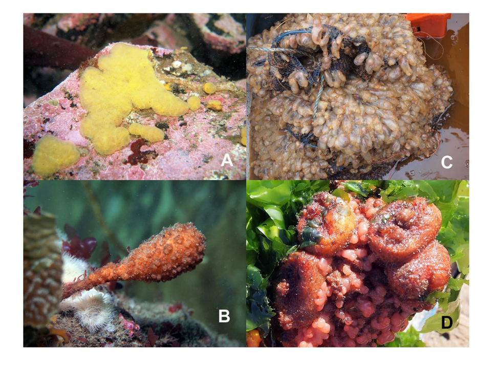
Figure 2. Some of the species identified at the Magellanic zone (left), and at the temperate zone (right). A, Distaplia colligans ; B, Polyzoa opuntia (stalked form); C, Ciona robusta (formerly C. intestinalis sp A) (on scallop culture gear); D, Asterocarpa humilis (on top of Pyura chilensis ).