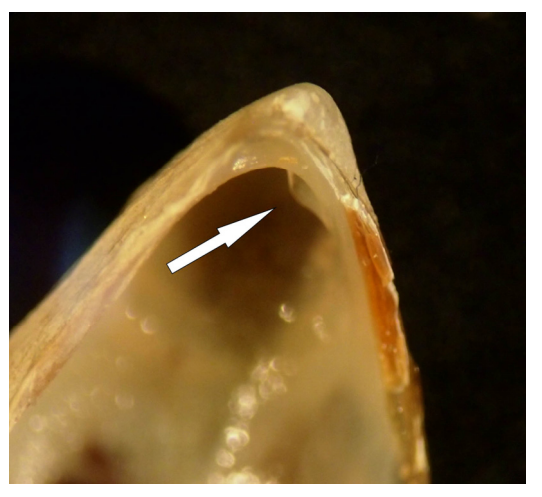
Figure 1. Inner shell of Mytilopsis leucophaeata illustrating (arrow) the tooth-like projection or apophysis.